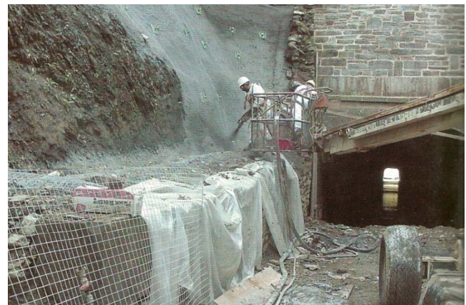
RIVER EMBANKMENT STABILISATION