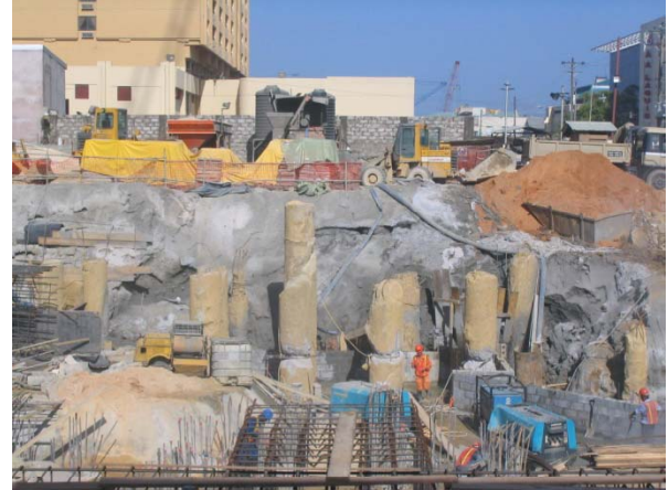
FOUNDATION SLOPE EROSION CONTROL